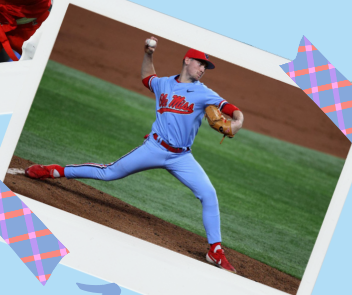
OLE MISS BASEBALL