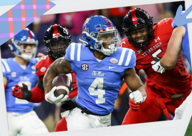
OLE MISS FOOTBALL

We host Welcome Week events and various events throughout the semester, such as a trip to New Orleans in the fall and ice skating in the spring. We also have a vibrant music, arts, and restaurant scene in downtown Oxford, in an area referred to as "The Square."