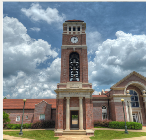
OLE MISS BELL TOWER