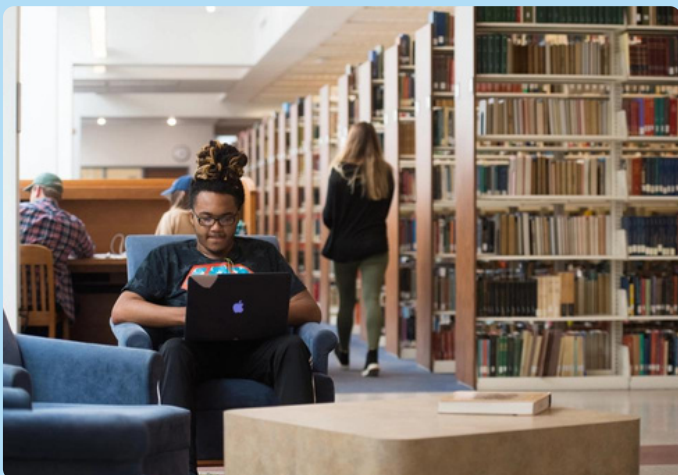
J.D. WILLIAMS LIBRARY

You can find all information about studying at our university as well as experiences from former exchange students on our website here .