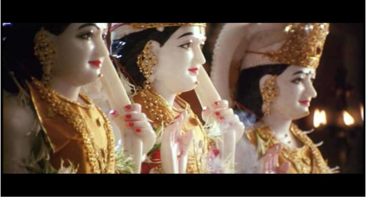
Lakshmana, Rama, Sita