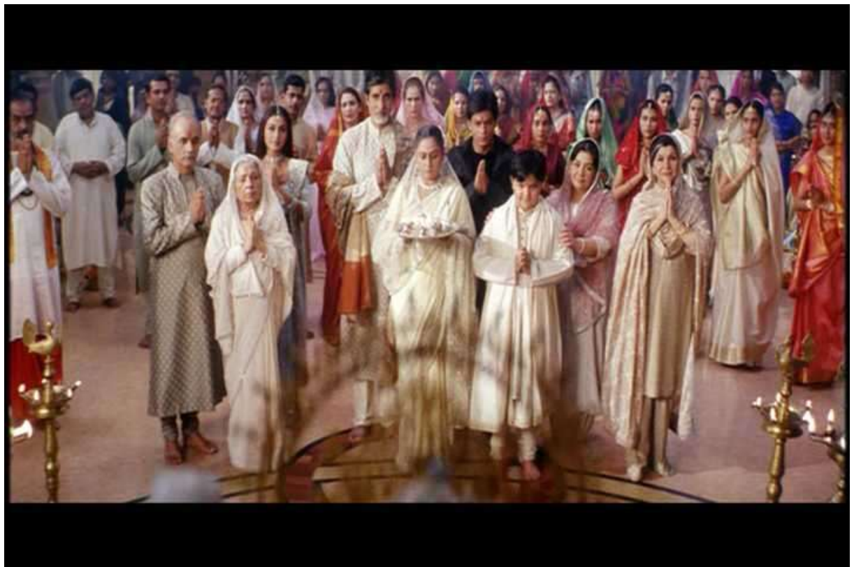
The Raichands at the diwali festival